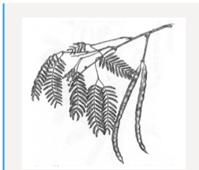
Honey Mesquite leaves and beans. Courtesy of: TREES, SHRUBS AND WOODY VINES OF THE SOUTHWEST by Robert A. Vines, Illustrated by Sarah Kahlden Arendale, Copyright ©1960

These Brush Busters control methods depend on the tree shape and size. For mesquite with three or fewer smooth bark stems coming out of the ground, the stem spray method may be a good option. For bushy mesquite less than 6 feet tall with many stems at ground level, the leaf spray method may be the best option. Either method can be successful.